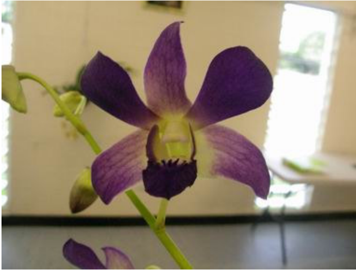
Den. Mozakotaki 'Blue'