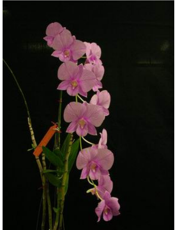
Dendrobium bigibbum var. superbum 'Stripe' x Dendrobium bigibbum 'Tozer Stripe' Owned by Charlie Truscott