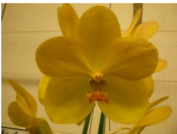
V. Penang Manila x V. Aurawan 'Yellow Bird'