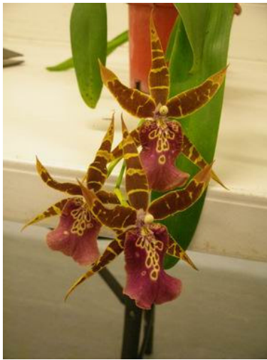
Miltassia Olmec x Milt. Sandy's Cove