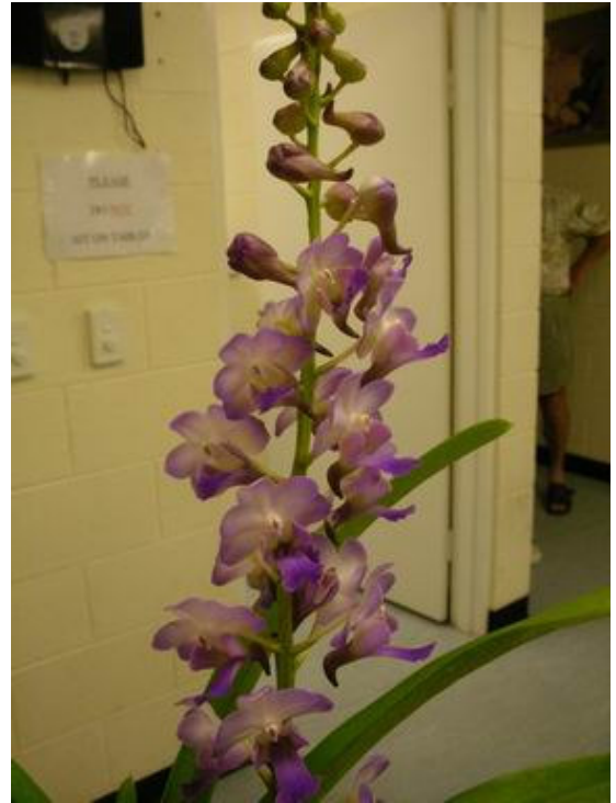
Aerides lawrenciae x Rhyn. coelestis