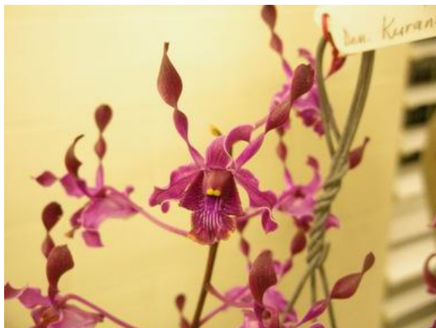
Den. Magic 'Kuranda' x Den. Kuranda Blue