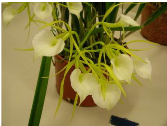
B. Little Stars