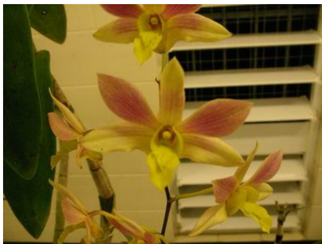
Den. Myall Aussie