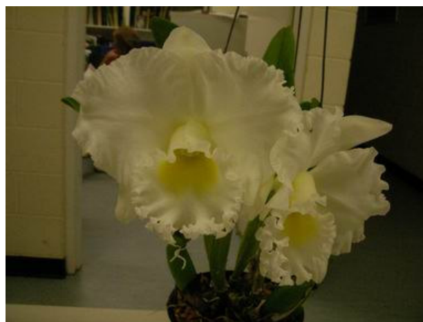
Blc. Burdekin Jewel 'Michelle'