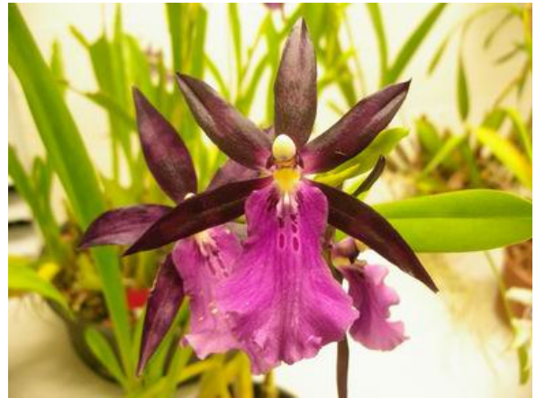
Miltonia spectabiles x Miltonia clowesii